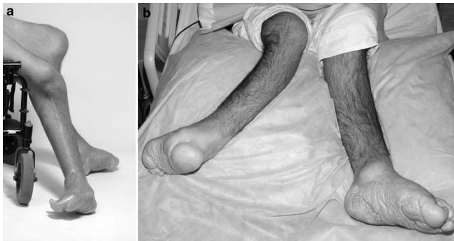
Figure 2 The progressive nature and severity of overgrowth in PS. Panel a shows a teenager with valgus deformity of the knee, fixation of the knee joint due to bony overgrowth surrounding the joint and external rotation of lower leg of more than 90^\circ . Panel b shows the same patient a few years later with continued external rotation of the leg that now exceeds 135^\circ with onset of bowing of the tibia. The surgical correction of such deformities is challenging.

The aforementioned predisposition to tumors is a thorny problem. First, the association is strongly suspected, but not proven. Second, although there are a number of tumor types that have occurred in more than one patient with PS, 29 the predisposition appears to be broad (ie, predisposition to a wide variety of tumors) and are not aware of any practical and effective method to screen for such tumors. Finally, there are no data to demonstrate that early detection of tumors in PS improves prognosis. For these reasons, we do not recommend routine imaging surveillance for tumors. Instead, we recommend regular check ups with a physician who has a relatively low threshold for ordering an appropriate evaluation if a patient develops signs or symptoms of a tumor.